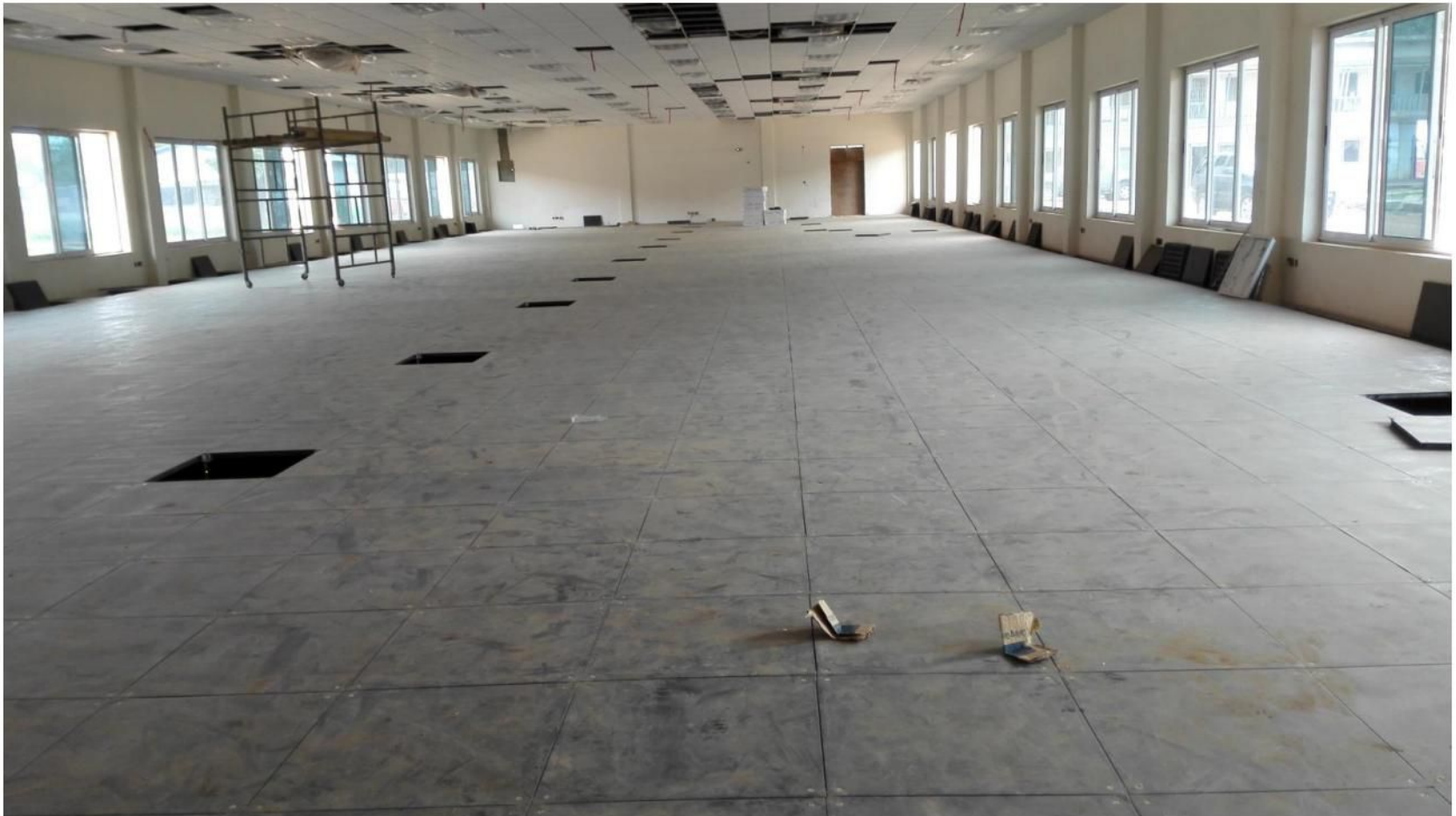
Raised Floor construction